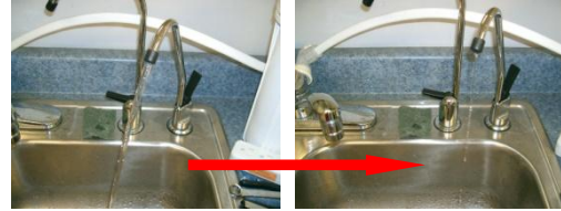
B : Open drinking water faucet